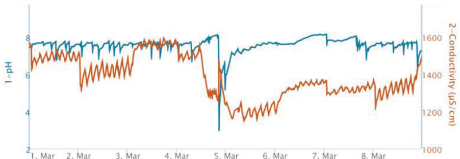
Figure 1 - 3D TRASAR System data from the event

In early March 2017, the System Assurance Center received a pH low alarm with a value of 3 from the plant's 3D TRASAR controller. The System Assurance Engineer immediately analyzed the situation and discovered an abnormal acid influx in the water line that runs across the PFHX application. If the pH remained low for a longer duration, it had the potential to irreversibly damage the asset. See Figure 1 for the data points that triggered the alarm.